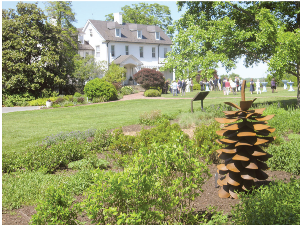
River Farm supporters gathering in front of the historic house.