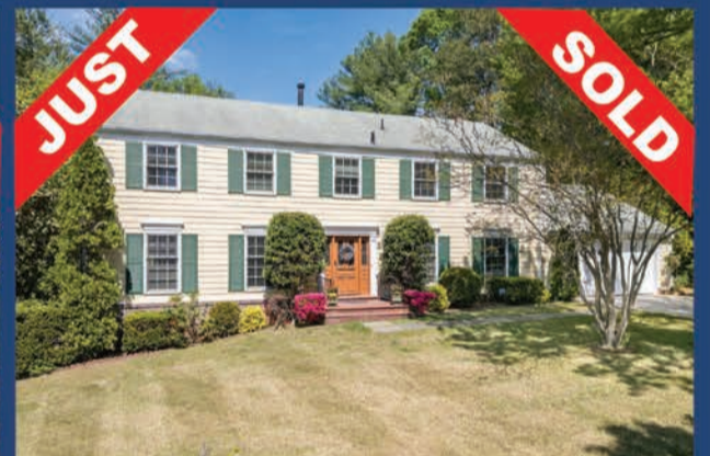
4212 Pickering Pl | $1,049,000