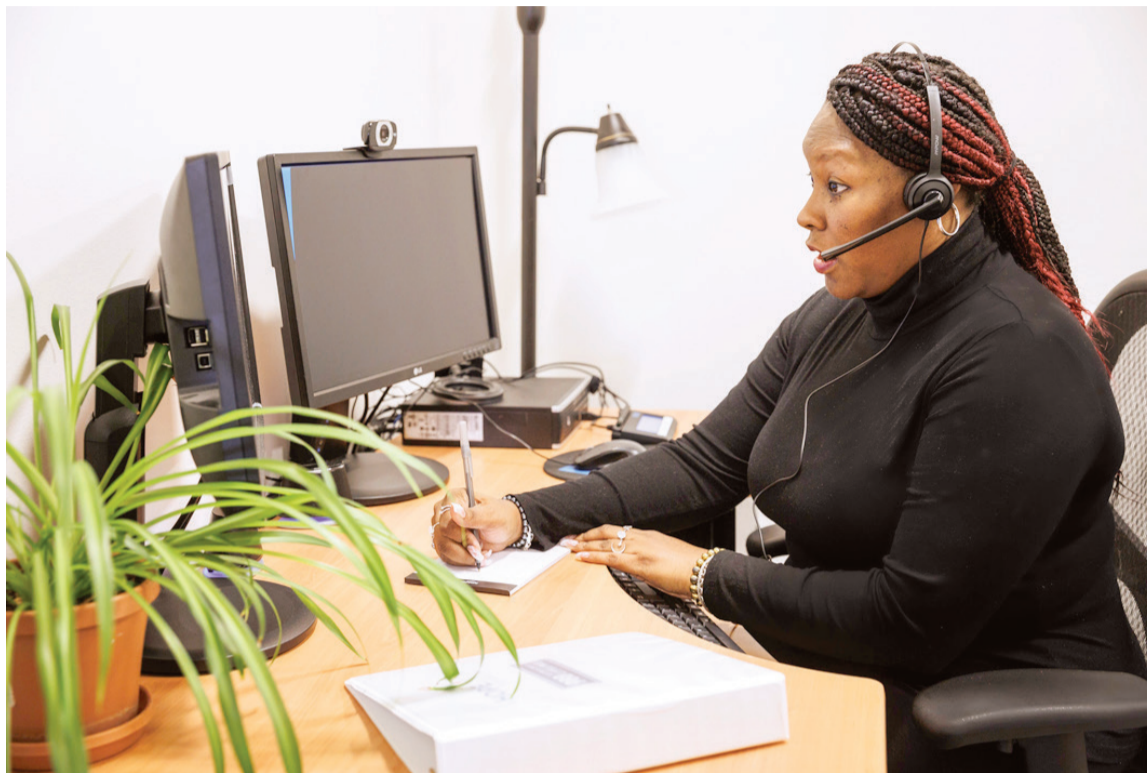
A crisis worker at HopeLink.

As one of our workers explained, "I have spoken to hundreds of callers. While no two calls are exactly alike, I find callers asking the same question again and again: 'Will I be okay?' What I can tell them is yes, one day, they will be okay, and this call is one step closer to breathing a sigh of relief. Together, we sit in that uncertainty and that pain, until they are empowered to seek longer-term support and explore what life might look like around the corner. When a caller tells me