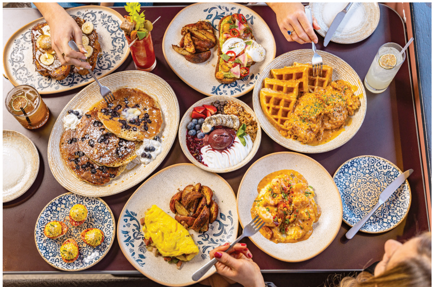
The Royal Restaurant features Mother's Day Dining on Sunday, May 10, 2026 in Alexandria.

❖ July 11: Take part in the City of Alexandria's 277th/USA 250th Birthday Celebration complete with fireworks, music and more at Oronoco Bay Park along Alexandria's waterfront.