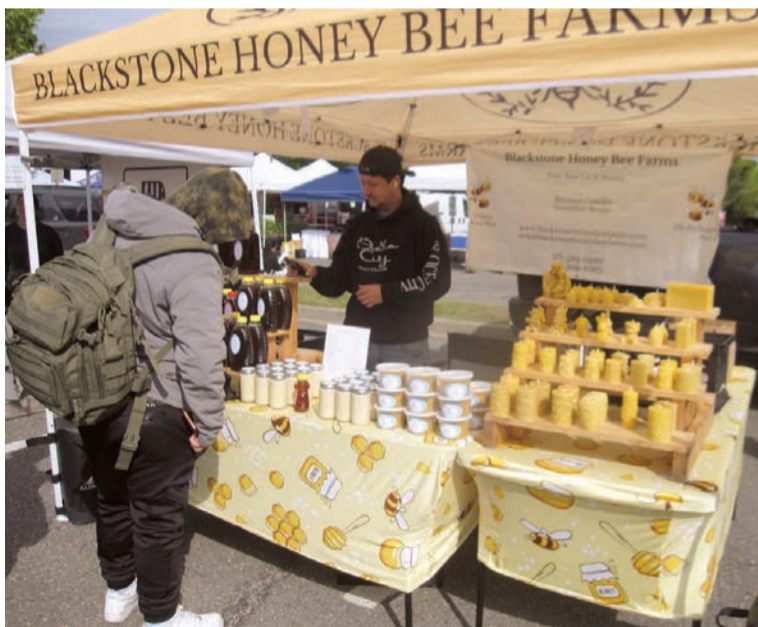
Black Stone Honey Bee Farms sells pure wildflower honey and bees wax candles

customers who have difficulty prying oysters open. "I steam them for 10 minutes and they'll pop open," she advised.