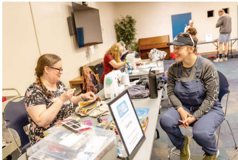
Here is a person getting sewing repair done at our Fix It Clinic last year. The next Fix It Clinic at Sherwood Library is May 9.