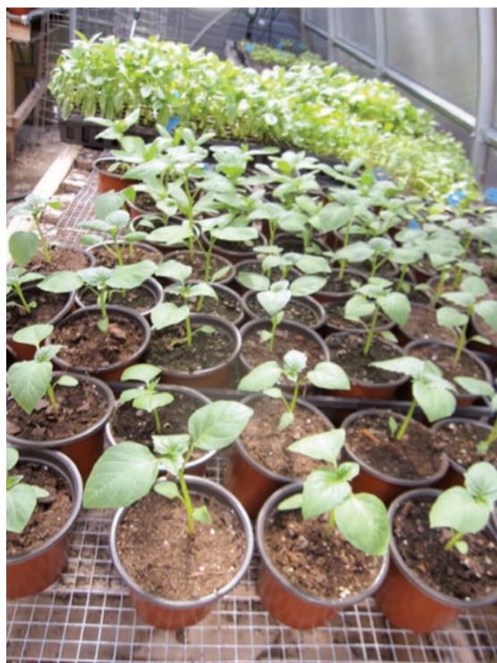
Several varieties of peppers are growing in the greenhouse.

He also sees food as health. For some of the people who come to Rising Hope, their meal there is their only daily meal and fresh vegetables can help them "be whole, a