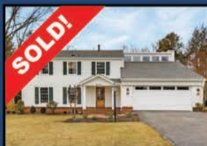
4206 Pickering Pl | $1,261,000