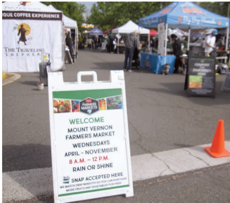
The market's sign greets shoppers.