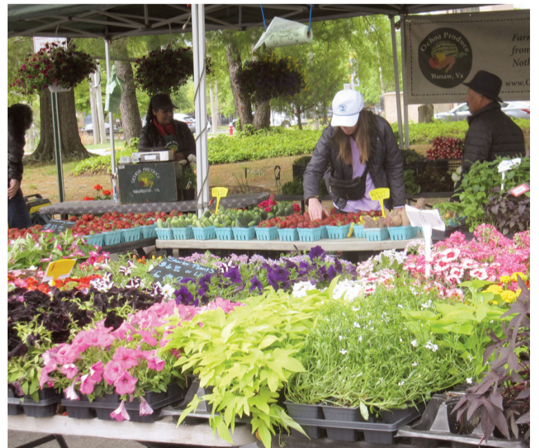
The Ochoa family has brought fresh vegetables and flowers to the market for many years.