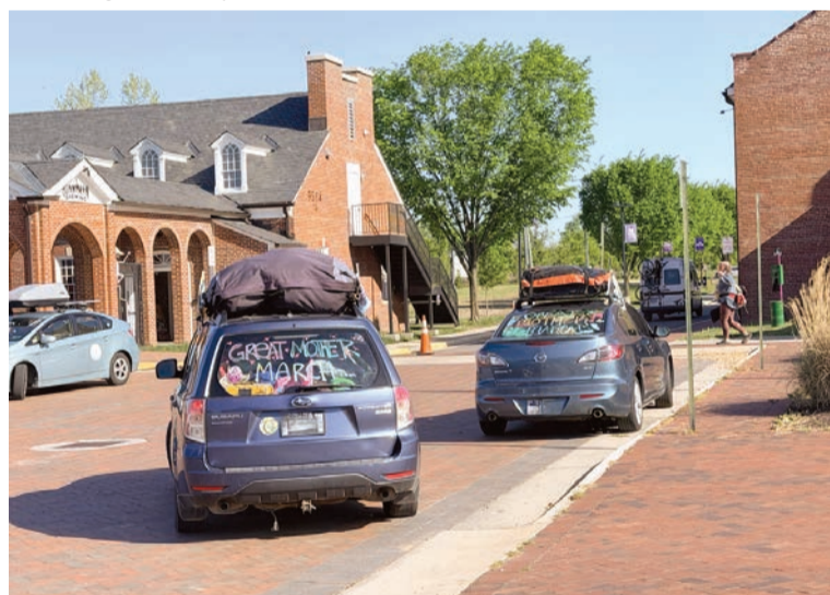
Fully packed cars provided rides for walkers and transported camping gear.

Indian medicine system emphasizing diet, herbal remedies and lifestyle. She sees art as "sacred; with the use of art to heal, and as a philosophy of finding a better way." At the Arts Center, they also took an opportunity to practice their "flash dance" choreography. About two dozen women participated in the dance at the side of the Tidal Basin in Washington DC, their final destination.