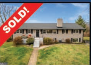
8912 Dogue Dr | $849,500