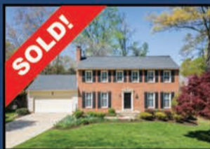
8306 Crown Court Rd | $1,175,000