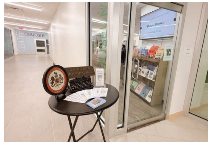
The front door of the new museum space.

Franconia Museum 7130 Silver Lake Blvd, Kingstowne, VA 22315