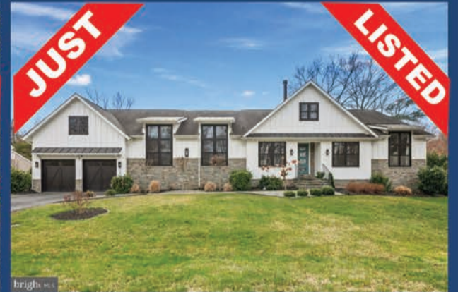
2203 Pennsylvania Blvd | $2,200,000