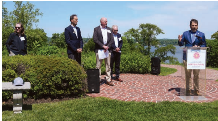
Senator Scott Surovell spoke about efforts to save River Farm.