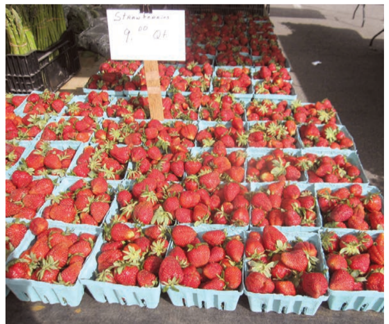
Strawberries were popular purchases.