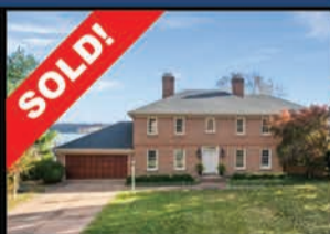
3903 Belle Rive Ter | $3,700,000