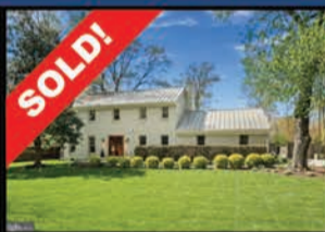
9410 Ferry Landing Ct | $1,300,000