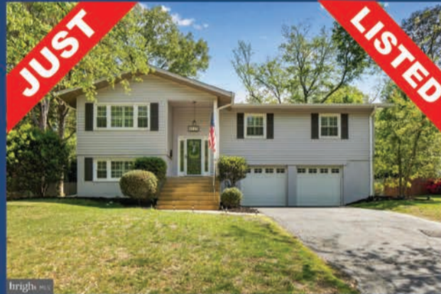
3115 Little Creek Ln | $899,000