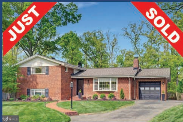
8910 Bordeaux St | $974,500