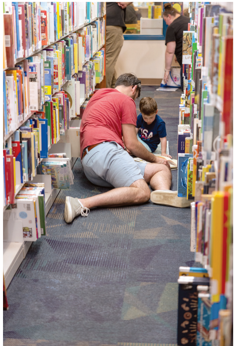
A dad and son deep into "checking things out" at Sherwood Library.

the Friends of Sherwood Regional Library hold a book sale, offering gently-used books and media. All proceeds support the library.