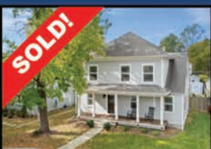
6404 13th St | $1,245,000