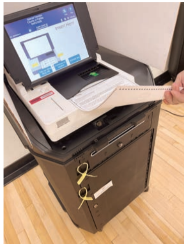
A voter casts a ballot at a Fairfax County polling place during the special election for a redistricting constitutional amendment, April 21, 2026. The passage of the referendum 51.69% to 48.31% could pave the way for a new congressional map.

After the April 21 referendum, Democrats framed the redistricting as a defensive, pro-democracy counter-move, while Republicans characterized it as an unprecedented constitutional overreach.