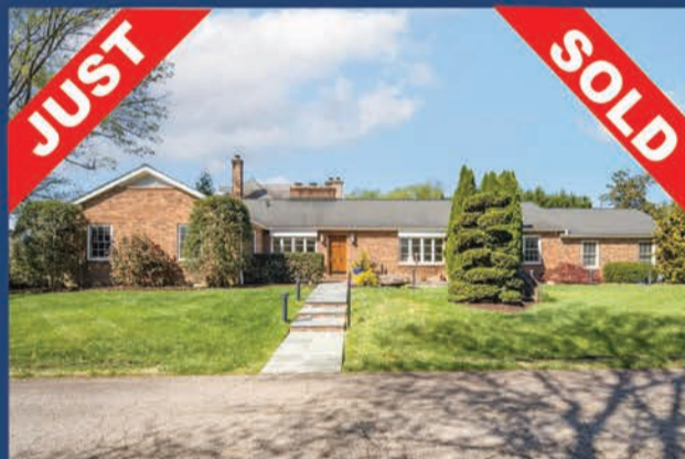
9352 Mount Vernon Cir | $1,150,000