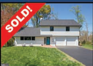
3104 Little Creek Ln | $906,000