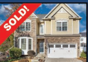
8047 Fairfax Rd | $1,375,000

LONG & FOSTER REAL ESTATE Alexandria/Old Town Historic 110 N. Royal St. 3rd Floor Alexandria, VA 22314