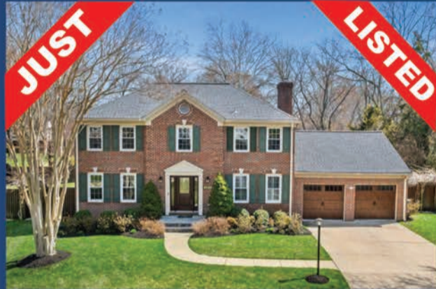
9426 Mount Vernon Cir | $1,595,000

50 homes SOLD in 2026 so far and 80 homes SOLD in 2025!