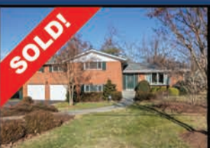
4008 Sulgrave Dr | $960,000