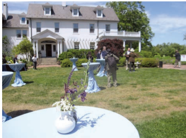
The gardens were in bloom and River Farm's flowers decorated tables.