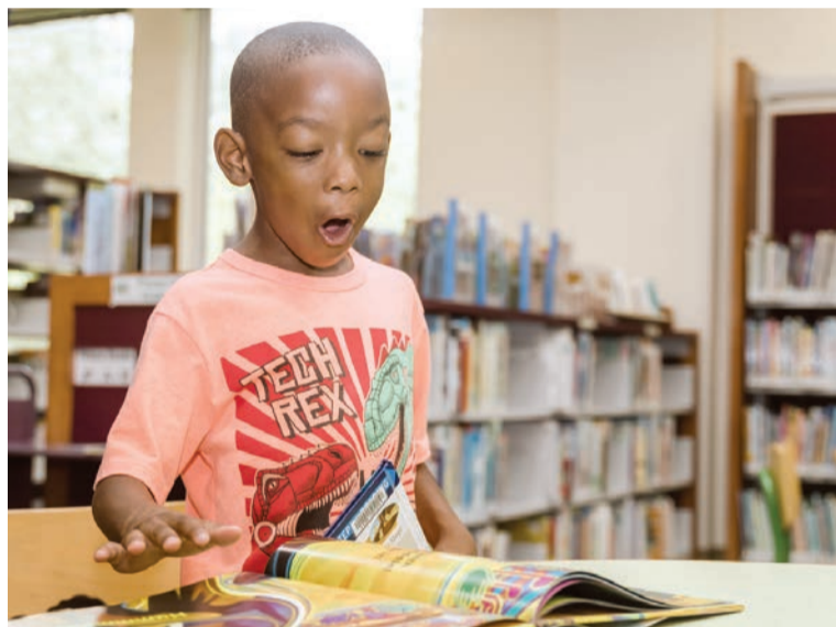
A delighted reader discovering new information in a book.