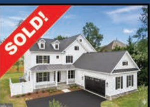
3608 Center Dr | $1,550,000