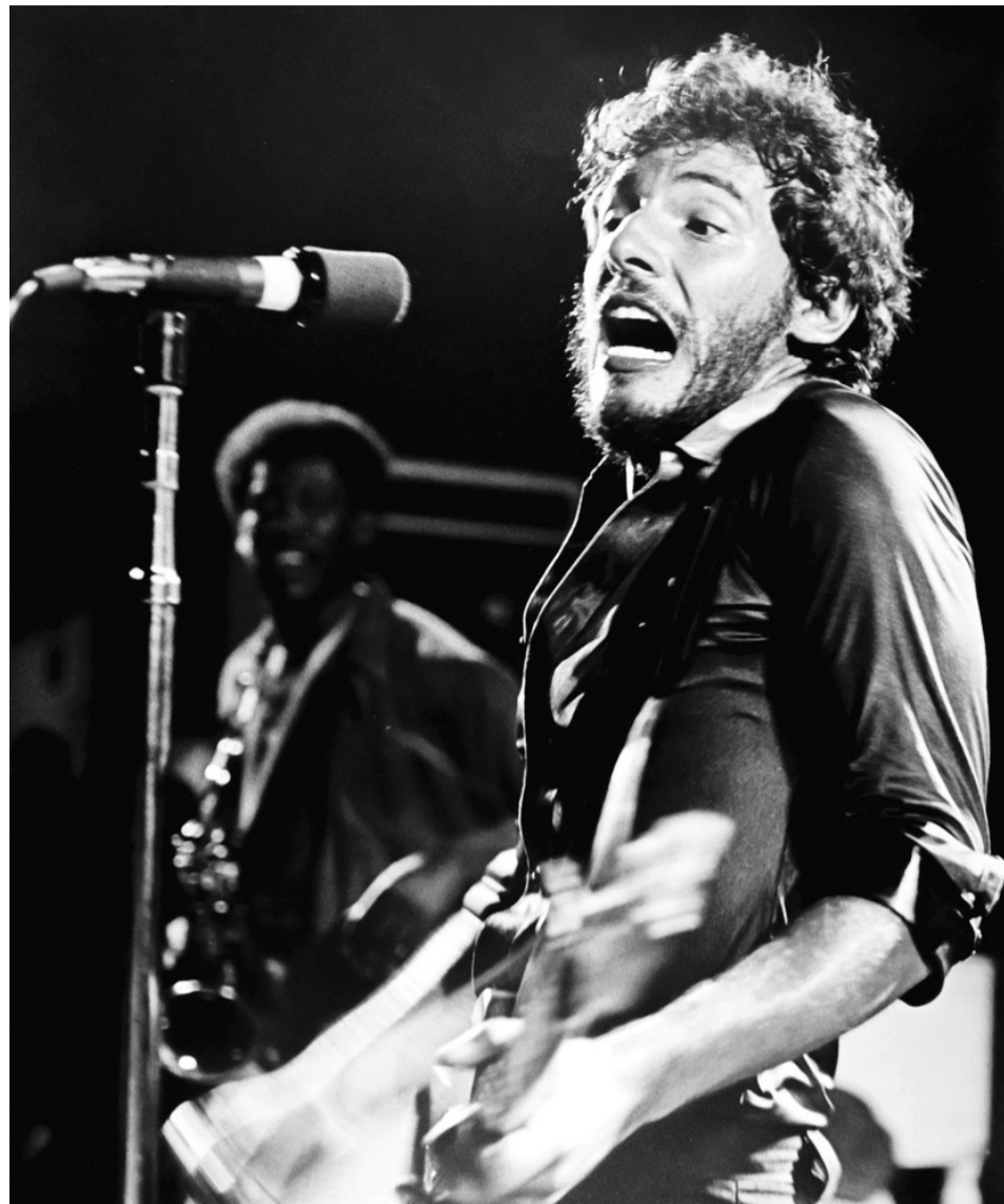
The Nepenthe Gallery presents an exhibition on Bruce Springsteen, "Greetings from Alexandria, VA" on May 8-10, 2026.