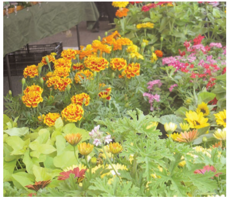
Several vendors bring spring flowers which brighten the market and boost spirits.