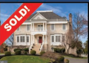
9498 Lynnhall Pl | $1,664,000