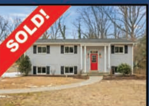
8711 Millbrook Pl | $775,000