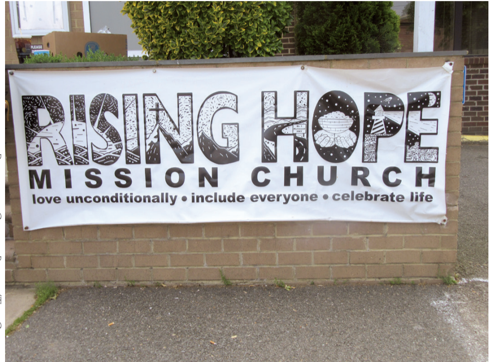
A sign in front of the mission church.